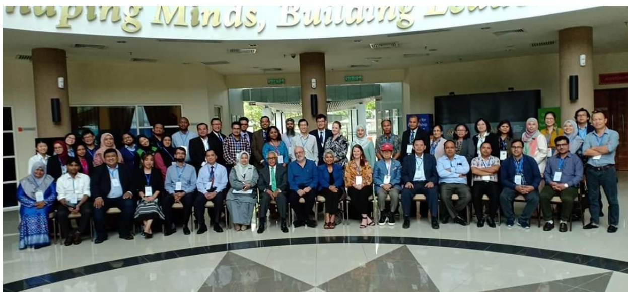
Participants and committee of the INGSA East Asia Capacity Building Workshop 2019

Forty seven participants from 13 countries (Malaysia, Vietnam, Indonesia, Philippines, Lao PDR, Singapore, Republic of Korea, Nepal, India, Sri Lanka, Pakistan, New Zealand and Nigeria) attended the International Network for Government Science Advice (INGSA) East Asia Capacity Building Workshop at the Malaysian Higher Education Leadership Academy (AKEPT) on the 13 th and 14 th of August, 2019. The workshop themed “Non-communicable Diseases & Science Advice” was co-organised between INGSA Asia, International Science Council Regional Office for Asia and the Pacific (ISC ROAP) and AKEPT, with Asia Research News as the official media partner.