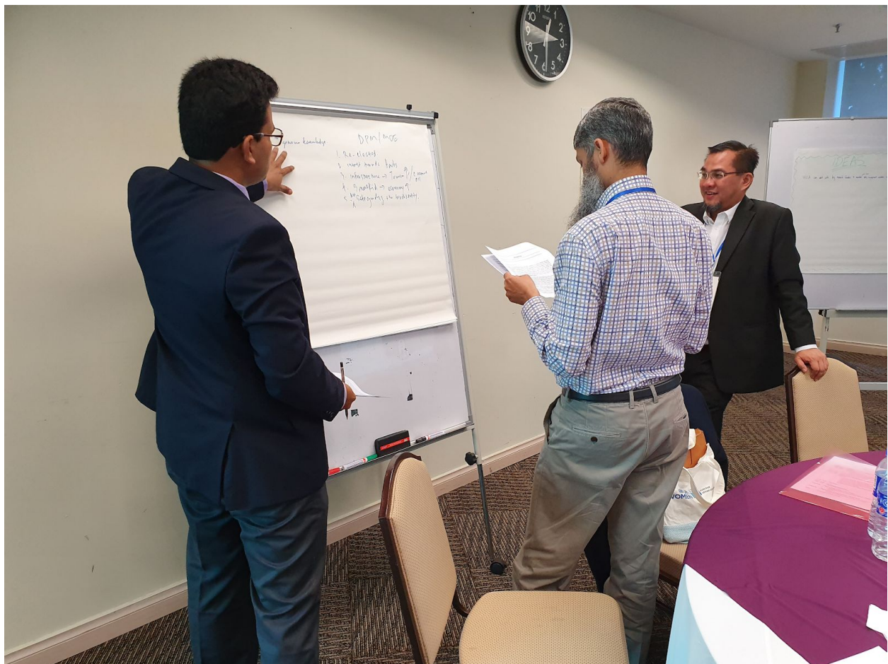
Participants presenting their perspectives for Case Study 1