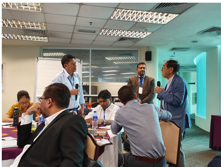
Participants engaging in the Q&A of Plenary Session 1