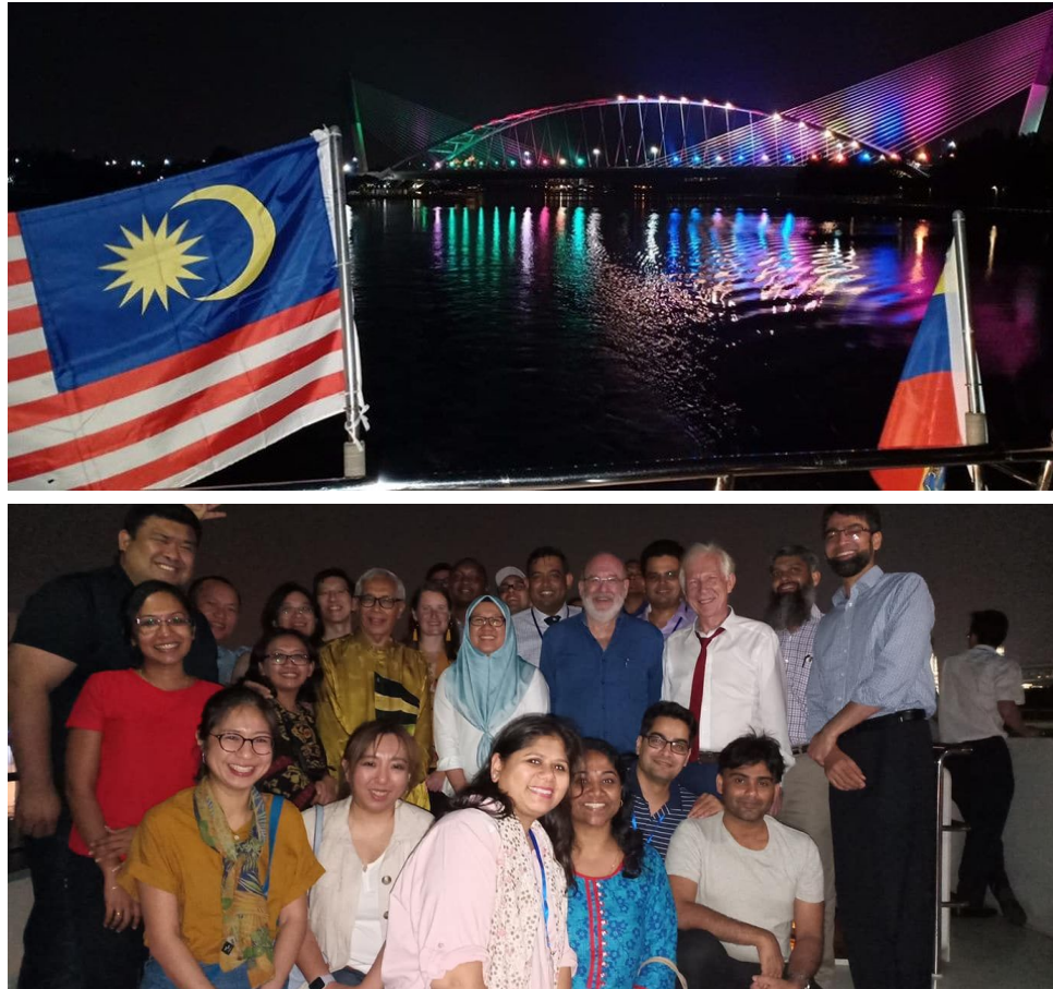
All smiles on board the cruise at Putrajaya Lake