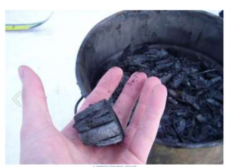
A PIECE OF BRI-CHAR