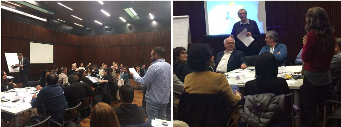
Group work and plenary feedback