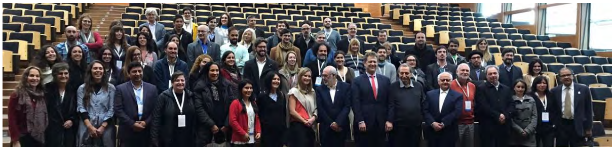
Group photograph of participants and facilitators at the INGS-MINCYT workshop, Buenos Aires, 29-30 June 2017.

- The remaining attendees were facilitators or observers , from INGS, MINCYT, The United Kingdom's Foreign & Commonwealth Office, the Ministry for External Relations in Chile, ICSU, UNESCO, AAAS, the University of Buenos Aires, as well as media, photographers and translators.