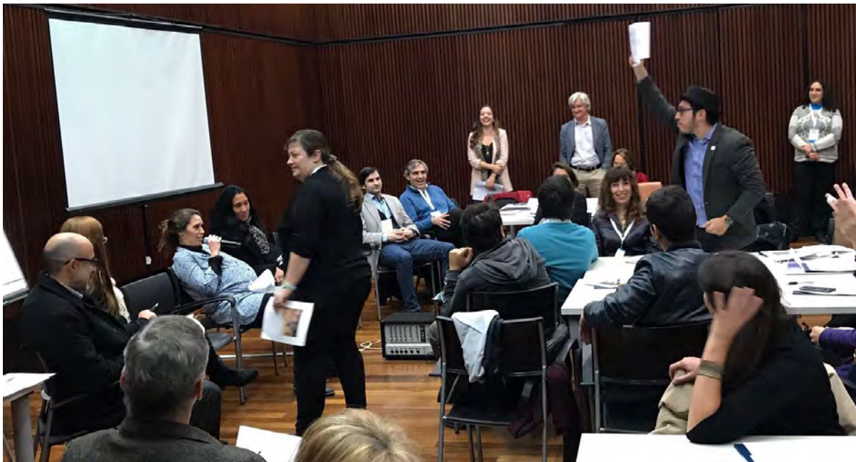
The final role-play exercise, where participants representing different stakeholders present to the Prime Minister of Panderia, only to be interrupted by role playing protesters.

In the last part of the workshop, there was an opportunity for reflection on what participants had gained from the two days, how they could apply some of these insights in their work and advisory roles, and learn how they could work with INGSA to strengthen training, capacity and networks for science advice across Latin America.