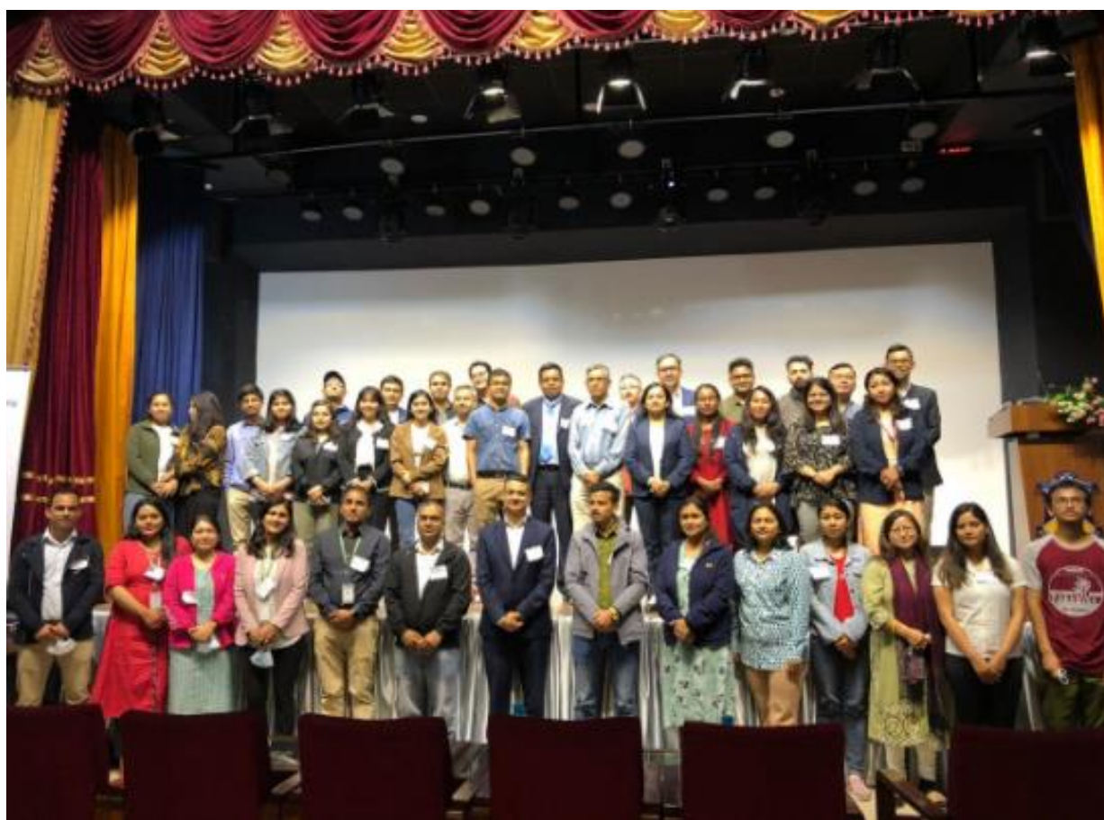
Figure 10. Group Photo after completion of the workshop.