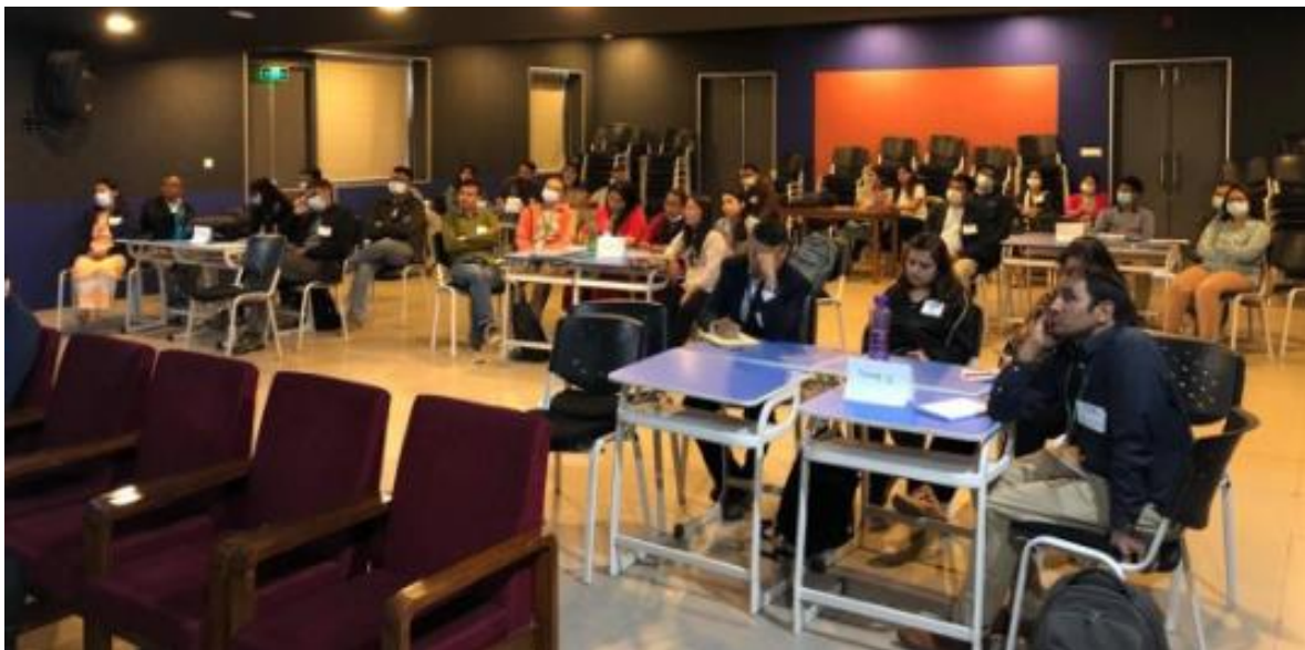
Figure 2. Participants of the workshop during speaker presentation.