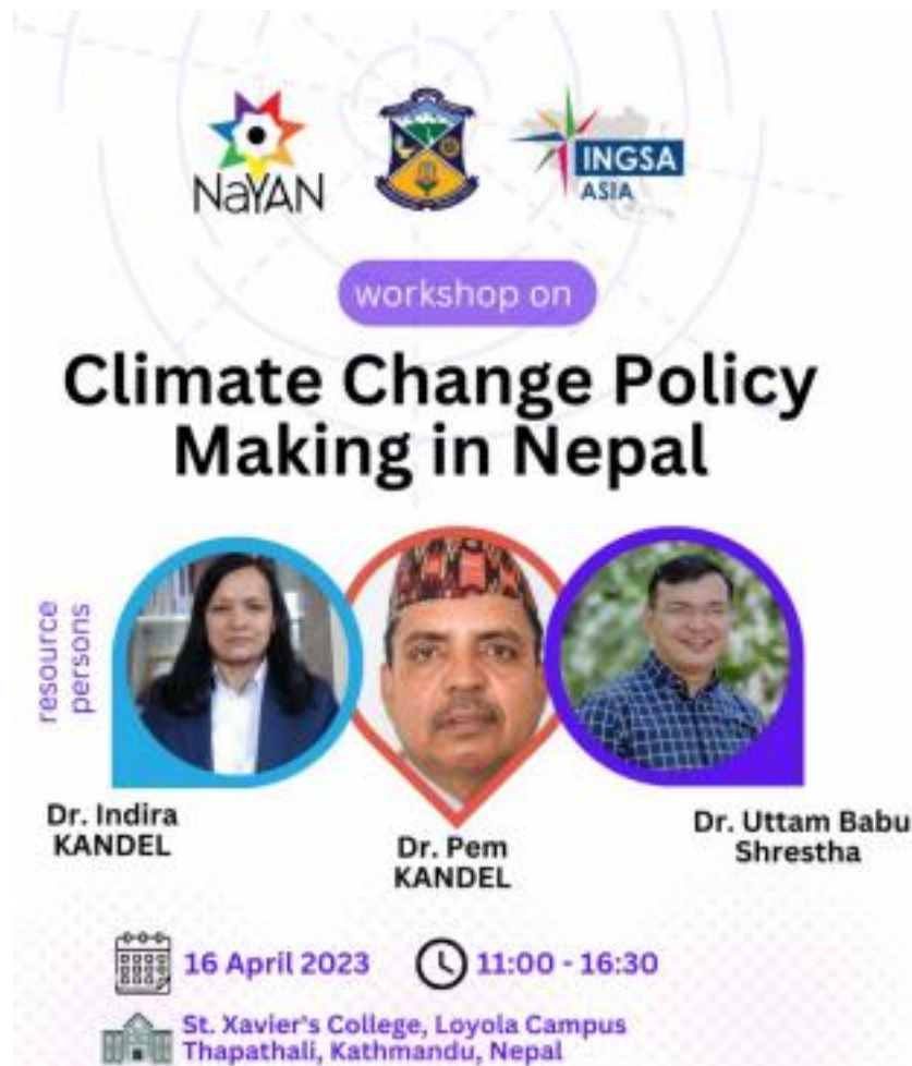
Figure 1. Flyer of the climate change policy making workshop in Nepal.

The one-day workshop on climate change policy making in Nepal aimed to sensitize early career researchers on the process and importance of climate change policy making in the country. National Young Academy of Nepal (NaYAN) and St. Xavier's College have jointly organized the "Climate Change Policy making in Nepal" workshop on 16th of April 2023 (11:00 am - 4:30 pm NST) at Loyola Campus of St. Xavier's College, Thapathali, Kathmandu, Nepal. This workshop is supported by the International Network for Government Science Asia (INGSA). An open call for participation was announced for early career professionals, researchers, and a total of 85 applications were received. There were total 32 participants as physical participants and the rest were considered for online participants. The workshop was attended by an equal number of male and female participants. The workshop provided participants with a comprehensive overview of the key aspects involved in developing effective climate change policies. The workshop involved three presentations by experts on climate change and policy making process in Nepal. The flyer of the workshop is given in Figure 1.