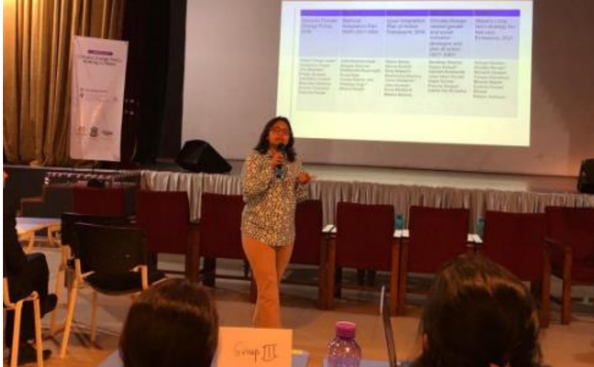
Figure 7. Group presentation by group leader on climate change policy of Nepal.