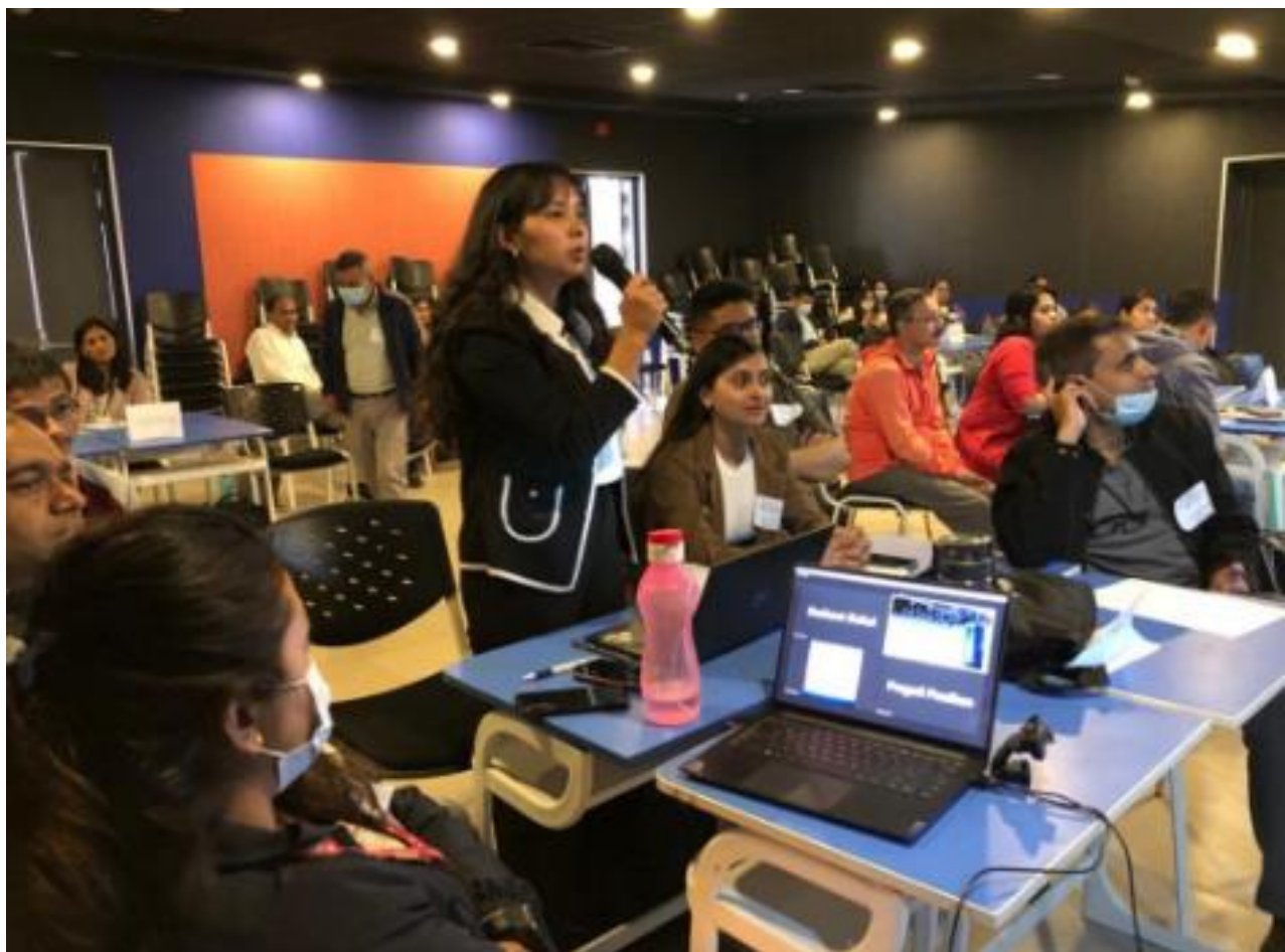
Figure 6. Questions and answer session.