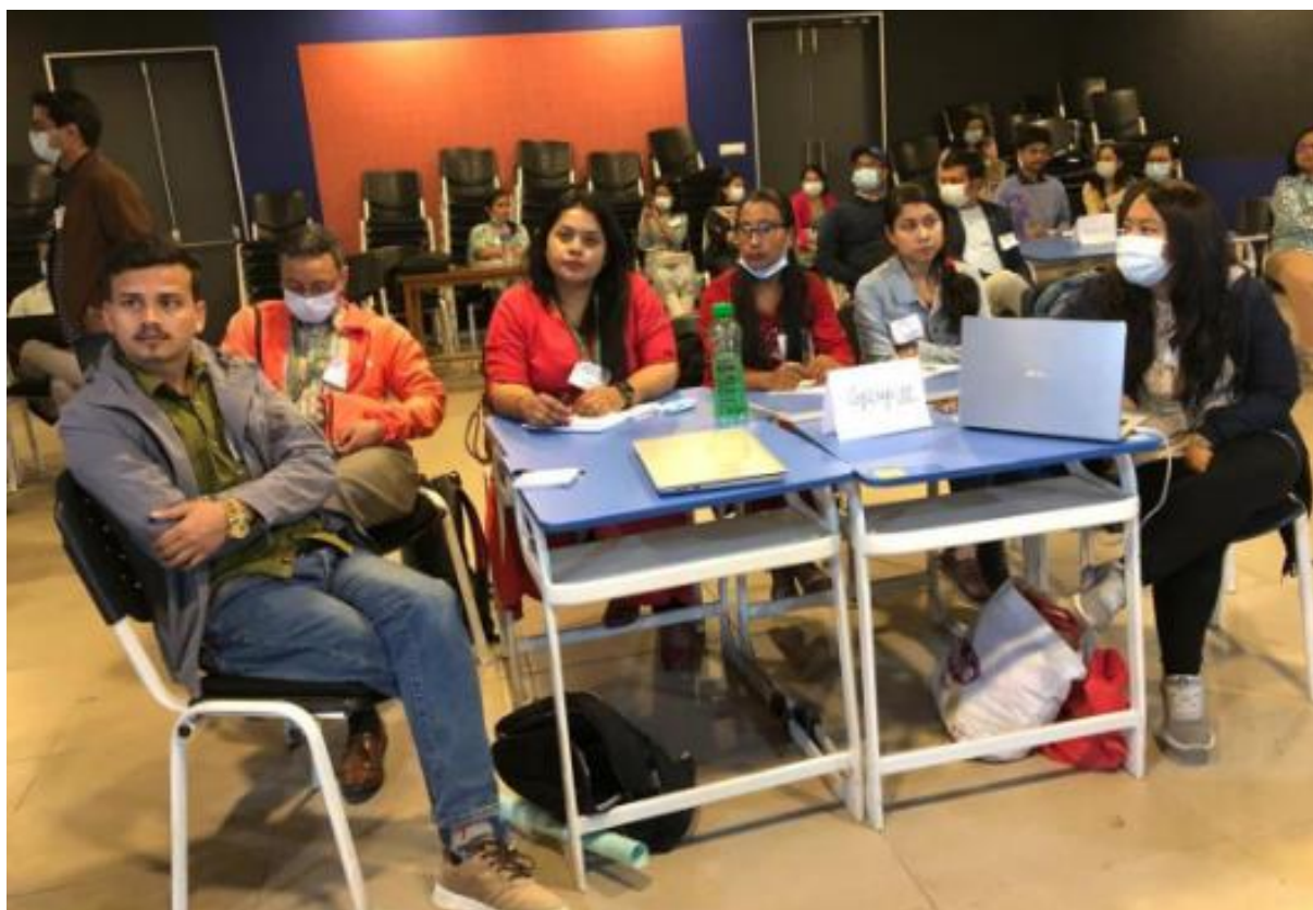
Figure 8. Group division and their arrangement during the workshop.